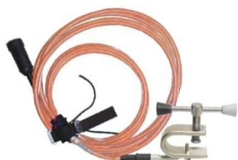
1-Phase Earthing Device JK238-DXF

Suitable as down line to earth when there is no "0" conductor. The device is for connection to framework up to 30mm thick.