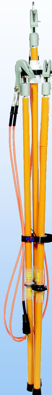
3-Phase Earthing Device JSKL3-QL Line length: 1,0+2,5+2,5 m Pole length: 1,3+1,5+1,3 m

The clamp can be fitted in inclined angle to the line!