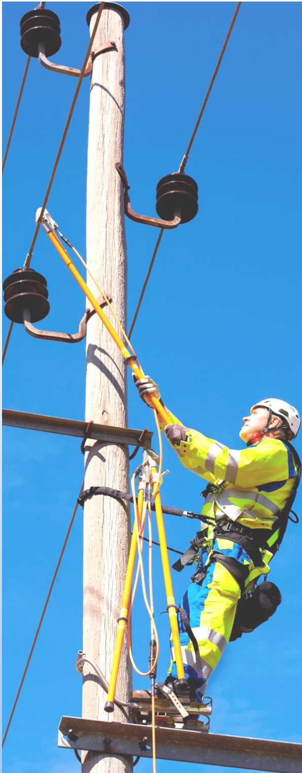
3-Phase Earthing Device JSKL3-QL with quick-lock-function Low- and high voltage 0,4 – 52 kV max 16,0 kA/1s