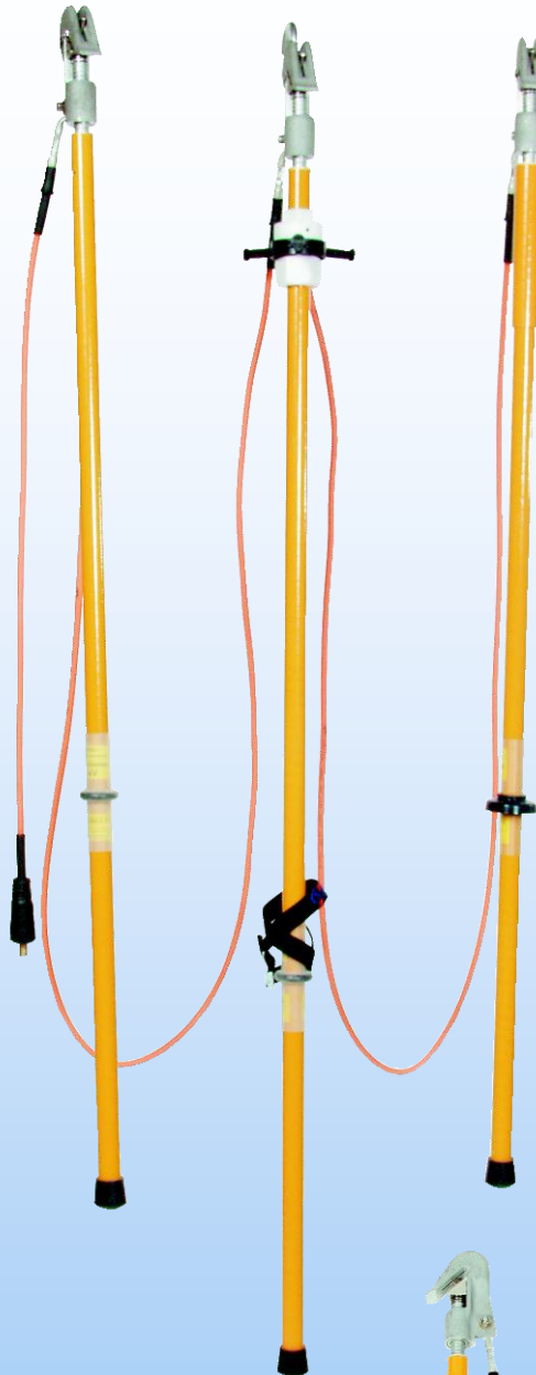
3-Phase Earthing Device JSKL3-TG Line length: 1,0+2,5+2,5 m Pole length: 1,3+1,5+1,3 m