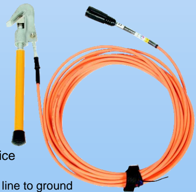
1-Phase Earthing Device JSKL1-JTG Recommended as down line to ground When working without "0" line Line length: 15 m Pole length: 0,3 m