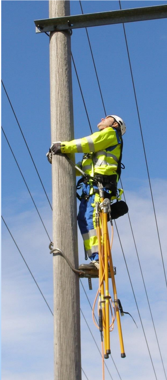
3-Phase Earthing Device JSKL3-TG equipped with buttress thread Low- and high voltage 0,4 – 52 kV max 16,0 kA/1s