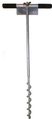
Rod Screw DJS 1 For temporary grounding