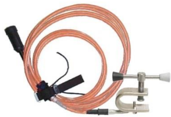
1-Phase Earthing Device JK238-DXF Suitable as down line to earth when there is no "0" conductor. The device is for connection to framework up to 30mm thick.